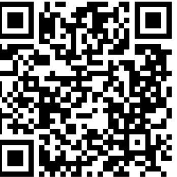
ass Registration VPS